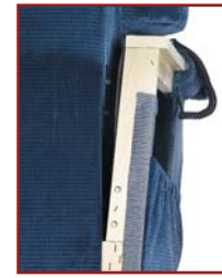
501 M shown

One size doesn't fit all with Golden Technologies seat lift chairs.