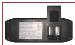
Battery Backup System

Sizes may vary depending on fabric, filling material, upholstery and carpet thickness. All measurements taken on concrete floor using levels and metal rulers.