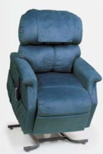
Comforter Junior Petite PR-501JP