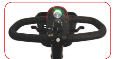
Wraparound Delta Tiller

The Go-Go® Sport delivers high-performance and convenience on the go. With a 325 lb. weight capacity, a charger port in the tiller, standard front LED lighting and a maximum speed up to 4.7 mph., the Go-Go® Sport is feature rich and travel ready.