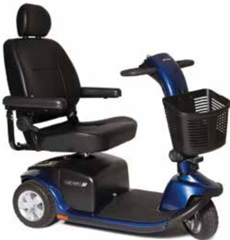
3-Wheel shown with optional 22" wide high-back seat

The Victory® 10 series offers added style, comfort and performance for your active lifestyle. Standard features include LED lighting package, backlit battery gauge, feather touch disassembly, wraparound delta tiller, 10" solid tires and a front basket. A 400 lb. weight capacity, a per charge range of up to 15.5 miles and a maximum speed up to 5.25 mph compliment the versatility of the Victory 10. Available in Viper Blue and Candy Apple Red.