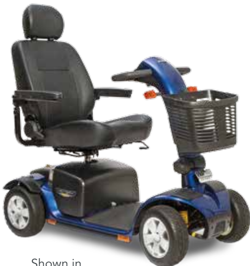
Shown in Viper Blue

The Victory ® Sport incorporates a sporty design with extra comfort and performance features for a truly unique ride experience. With a maximum speed of 8 mph—the fastest within the Victory Series—this scooter will accelerate your active lifestyle. Standard features include feather touch disassembly, wraparound delta tiller, 10" solid tires, front and rear suspension, high-back reclining seat, directional signals, a high-intensity LED lighting package, backlit battery gauge and a front basket. Available in Viper Blue and Candy Apple Red.