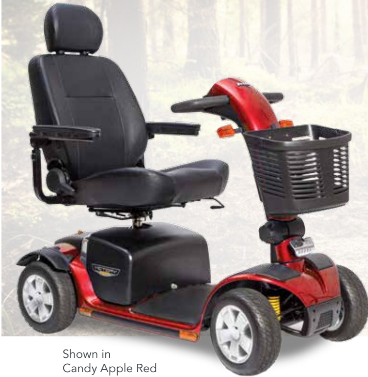
Shown in Candy Apple Red