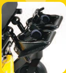
Angle Adjustable Centermount Footrest